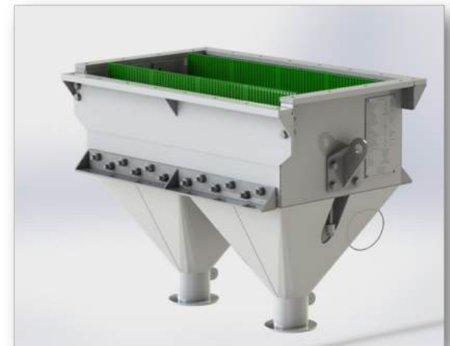
DUAL-CONE BELT WIPE